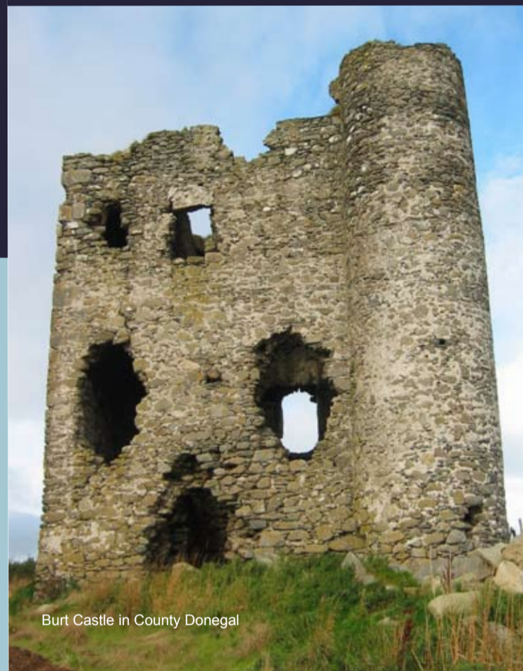
Burt Castle in County Donegal

To start this journey we want to give you a small historical synopsis of the earlier rulers of Ulster and their departure from Rathmullan. The purpose of this tourist trail is to highlight the rich historical identity in relation to the arrival of the Scottish and the influence they had on Donegal, Londonderry and Tyrone. The area identified in this brochure was by far the strongest settlement of Scottish Presbyterians into Ulster. Their contribution substantially influenced the shaping of Irish history and they went on to further influence American history. It is well documented that the ancestors of three former American presidents came from this area. We ask you as visitors to explore the diversity of historical locations that these three counties have to offer.